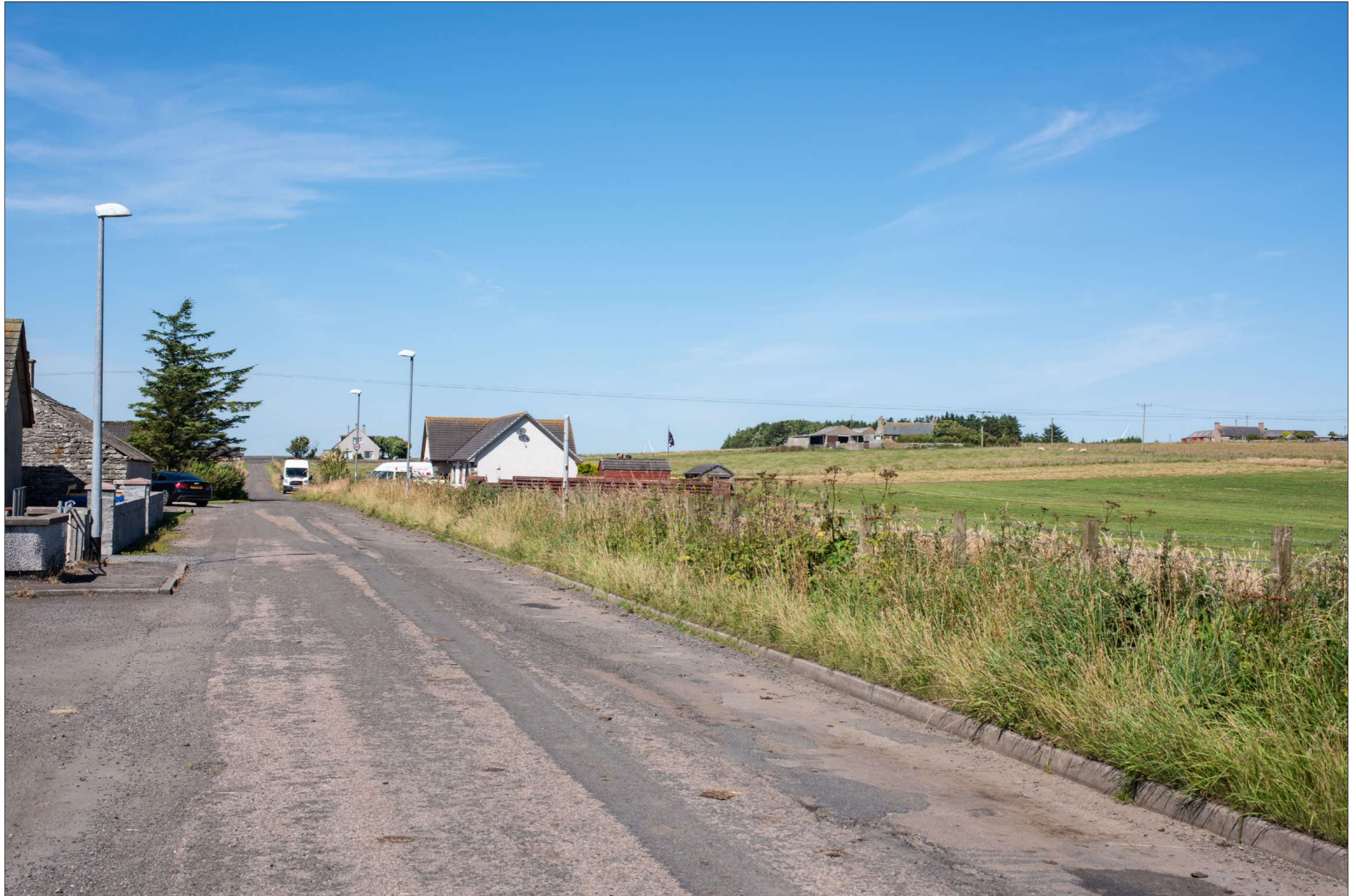
Figure: 7.27-THC-03 Viewpoint 14: Keiss

When viewed at a comfortable arm's length (approx. 500 mm), this printed image is representative of our detailed central vision, but is not representative of scale and distance.