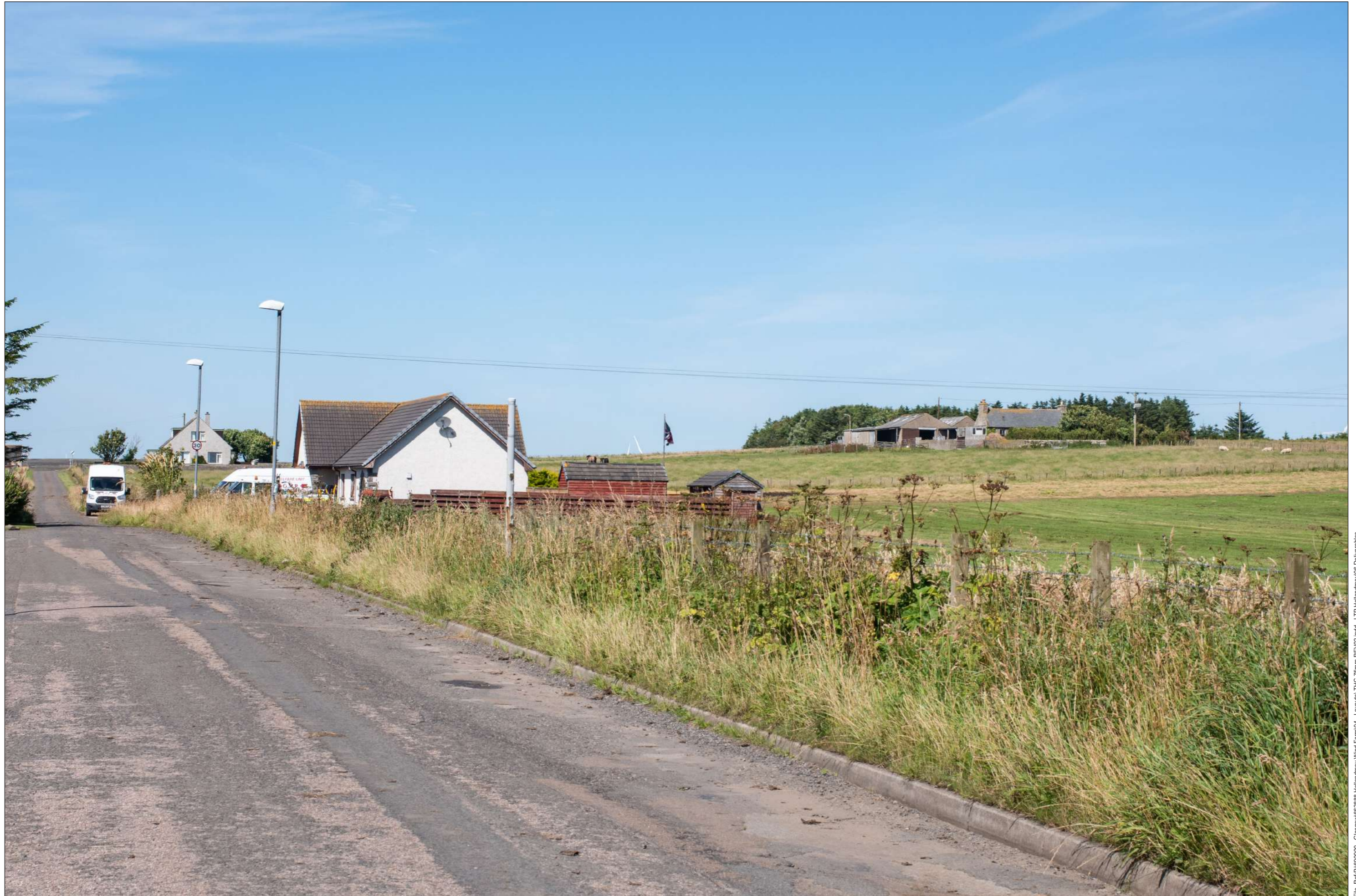
Figure: 7.27-THC-04 Viewpoint 14: Keiss

This image should be viewed at a comfortable arm's length (Approx. 500 mm)